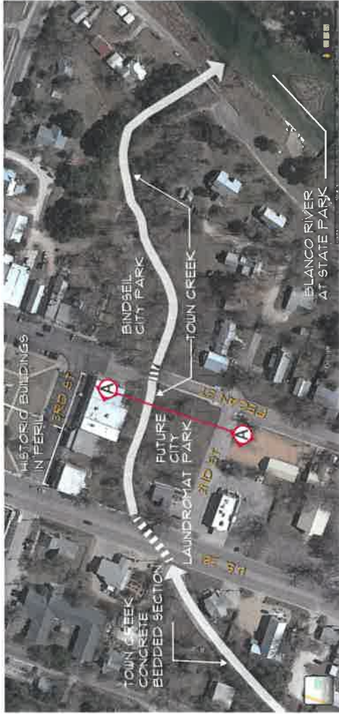
CITY OF BLANCO, TOWN CREEK AREA PLAN

Additionally, there are two old bridges that cross the creek. One supports Hwy 281, a major thoroughfare, and one is located near the square and is showing some signs that significant repairs by be needed for safety. Because we are a small municipality, only 1800 citizens (Though we serve a much larger community that lives in the areas surrounding the town), we cannot possibly afford the expertise in hydrological and civil engineering as well as the construction costs necessary to protect our property and heritage that will be lost when the town square is destroyed. The U.S. Army Corps of Engineers has all the valuable knowledge, experience and resources to help protect our community and prepare us for the best possible outcome when the next major flood event occurs. As a member of the governing body of the city of Blanco, I am asking you to help us. We would be extremely grateful for a visit and consultation by one of your experts to evaluate this project and consider it as one of the flood mitigation, historical preservation, and conservation projects of the Corp.