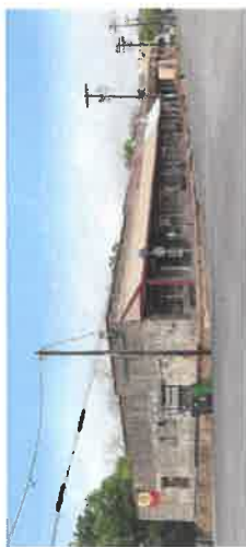
VIEW OF HISTORIC BLOCK