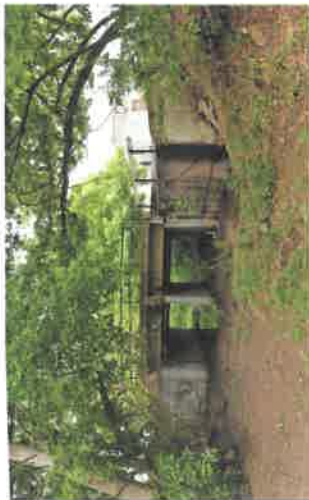
BRIDGE OVER TOWN CREEK ON PECAN ST.