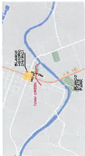
CITY OF BLANCO, PARTIAL VIEW