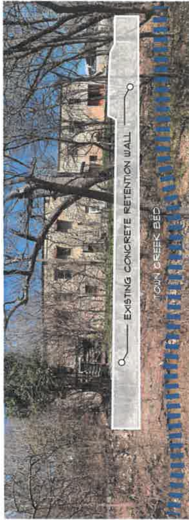
BACK VIEW OF HISTORIC BUILDINGS, FACING TOWN CREEK